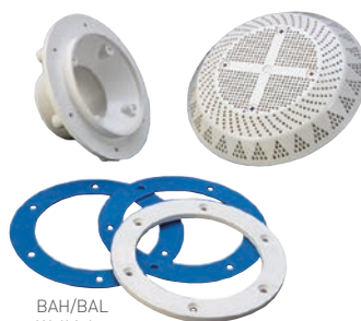
BAH/BAL Wall inlet