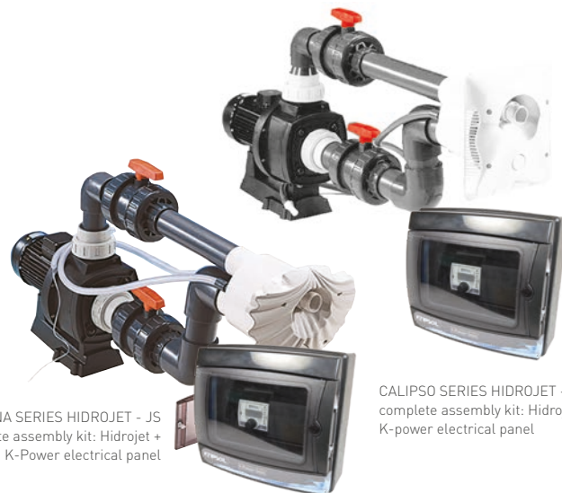
SENA SERIES HIDROJET - JS complete assembly kit: Hidrojet + K-Power electrical panel