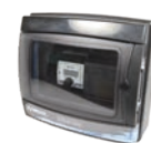
K-POWER FOR COUNTER-CURRENT