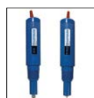
pH - ORP and Goldline probes