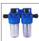
Double probe holder