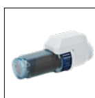
Transparent cell with Hayward® T-Cell technology